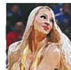
Golden State Warrior Girls