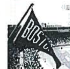
100 Years of Fenway Park